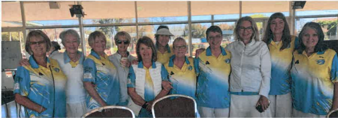
Most of our Ladies Teams Members 1st 2023 Gala Day