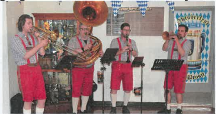
The Oompah Band