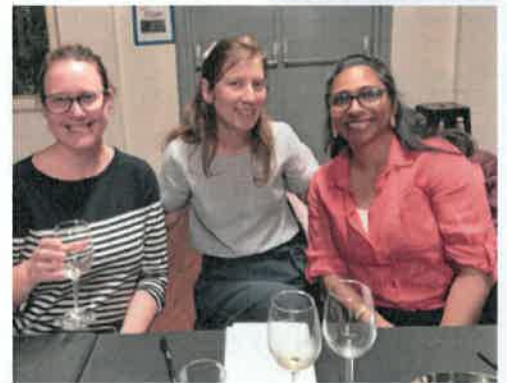
Wine Tasting Guests