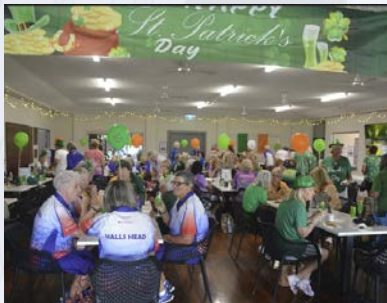
The Ladies teams enjoying their delicious lunch and the wonderful company