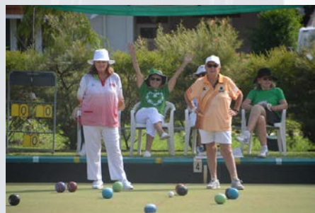
Great bowling by all participants